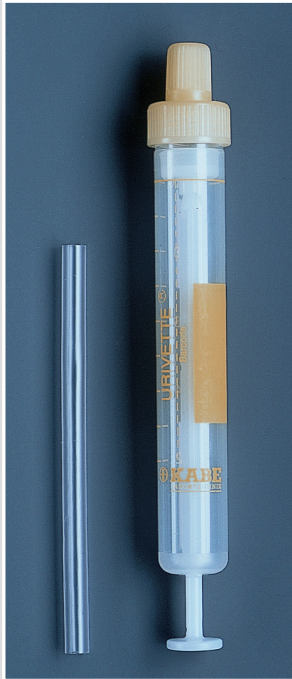
URIVETTE® (8 ml and 10 ml, sterile and unsterile)