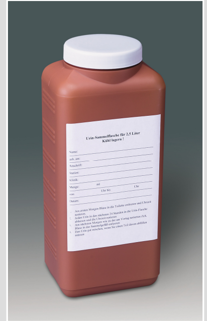
Urine collection bottle (2000 ml and 2500 ml)

URIVETTE® is a disposable urine collection device with scale, screw cap and suction tube. URIVETTE® BAK offers the stabilisation of the bacterial count in the urine for about 24h.