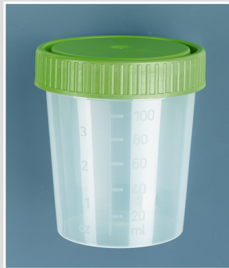
Urine cup with screw (100 ml, sterile and unsterile)